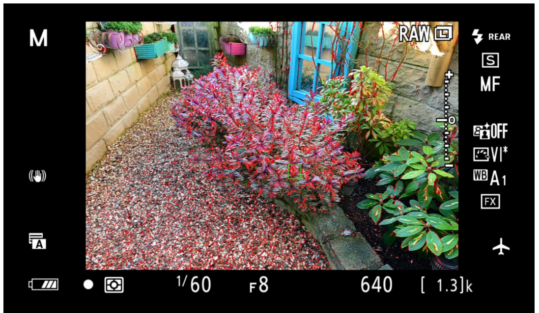
FOCUS PEAKING ON